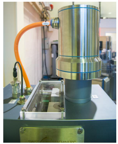
When the systems are used for pharmaceutical or food manufacturers, Swiss Can Machinery prefers to use the AKMH stainless steel servo motors from KOLLMORGEN

Aside from the time saved in development, the OEM and operator equally benefit from the consistency in the control cabinet based on the high degree of standardization, which also limits the effort and expenditure related to provisioning spare parts. "We can cover a wide range of completely different tasks with one single AKD servo controller", says Silvester Tribus in summary.