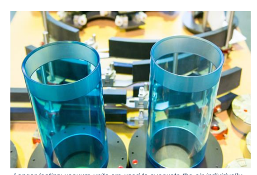
Longer lasting: vacuum units are used to evacuate the air individually and precisely from each can..

The design for complete format sets plays a vital role in reducing unproductive conversion times. These are uniformly color-coded as a set. The machine operator just needs to exchange a complete color in the event of a product change with different packaging. "This prevents any mix-ups and makes the conversion process faster and safer", states Marc Grabher. The colors do not involve any languages, which turns out to be a real advantage with exports.